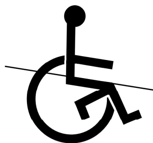
Forwards = not allowed

1.5. A wheelchair may be equipped with a rear supporting wheel, which may extend beyond the main wheels.