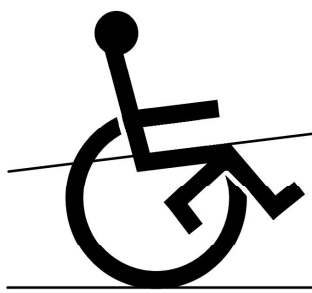
Backwards = correct